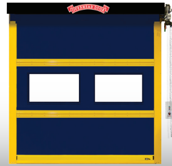
STRUTTED HEAVY-DUTY HIGH SPEED FABRIC DOOR MODEL 994