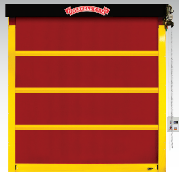
STRUTTED HIGH SPEED FABRIC DOOR MODEL 992